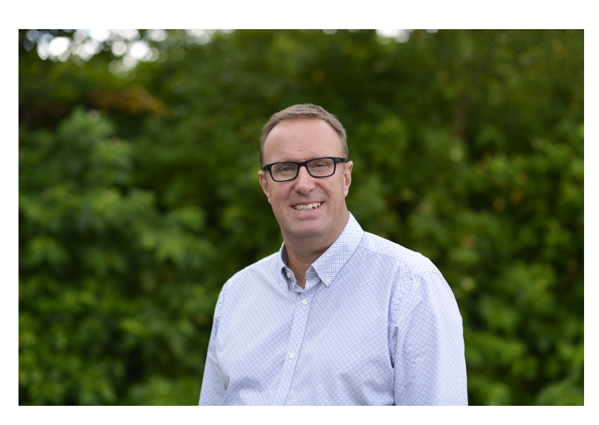
DAY IN, DAY OUT IT IS A PRIVILEGE TO WORK WITH SO MANY GREAT COLLEAGUES, SHARING AN INTEREST IN DOING A GREAT JOB.